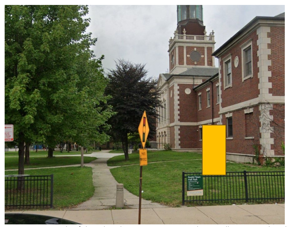
Image is on east side of the cultural center next to Central Ave. Yellow rectangle indicates possible sculpture location.