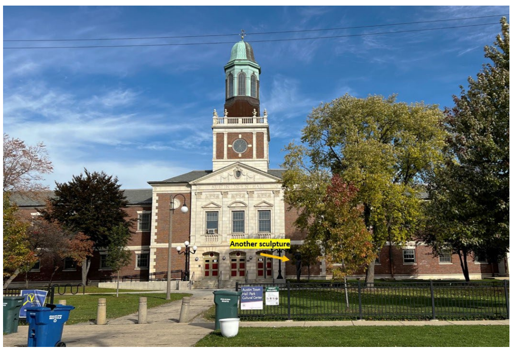
Austin Town Hall Park front entrance, that faces south.